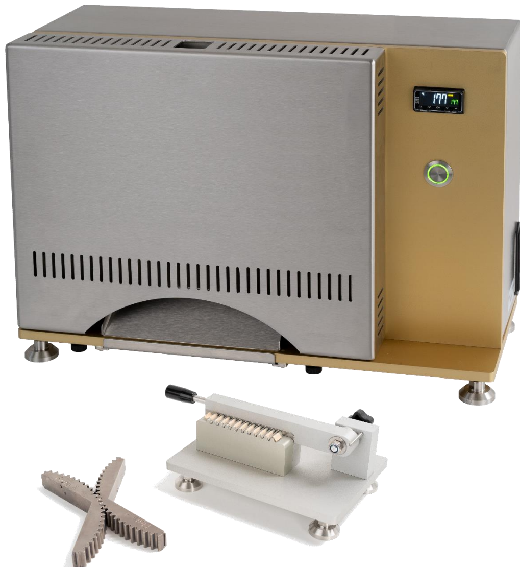
segment & 3rd hand