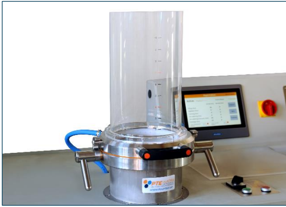
Stainless steel sheet former column