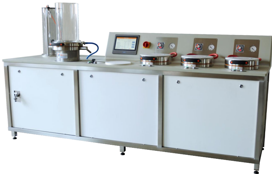
Rapid Köthen automatic model with white water circulation & 3 dryers