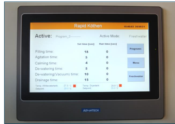
10" water resistant touch panel