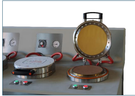
Stainless steel dryers