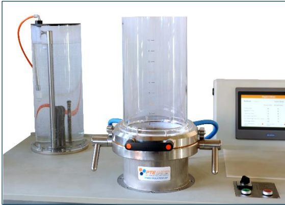
Sheet former column & white water tank