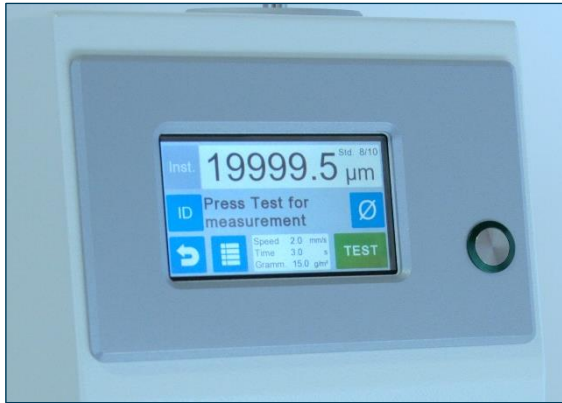
User-friendly operation via touchdisplay