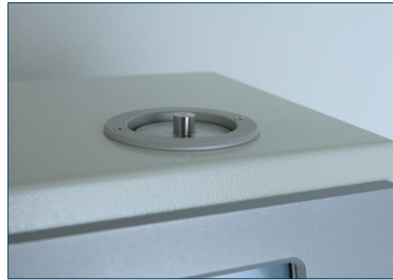
Measuring weight F