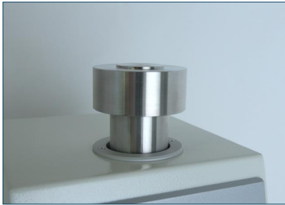
Measuring weight A