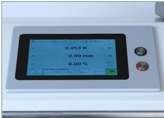
Touchdisplay & auxilliary buttons