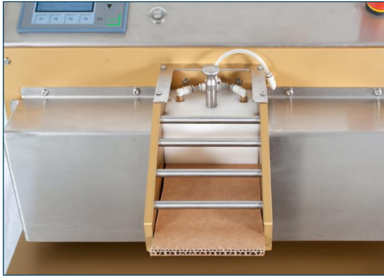
Sample feeder with fixing block